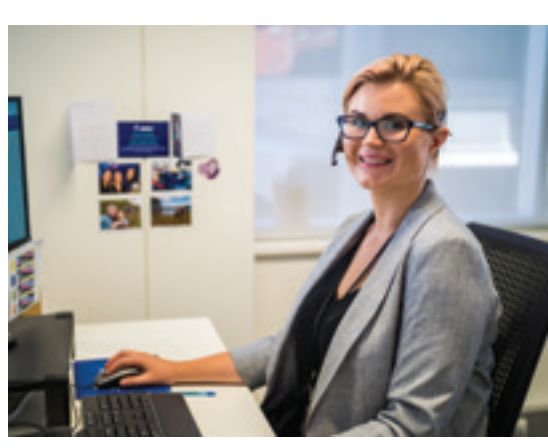
Our Student Adviser team can help you with study admin and non-academic related questions.

Visit unisaonline.edu.au/support to find out more.