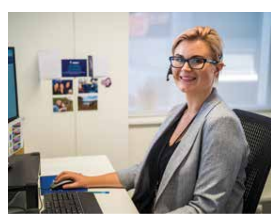
Our Student Adviser team can help you with study admin and non-academic related questions.

Visit unisaonline.edu.au/support to find out more.