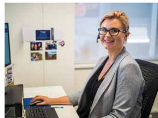
Our Student Adviser team can help you with study admin and non-academic related questions.

Visit unisaonline.edu.au/support to find out more.