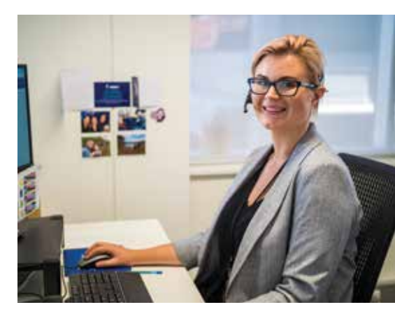
Our Student Adviser team can help you with study admin and non-academic related questions.

Visit unisaonline.edu.au/support to find out more.