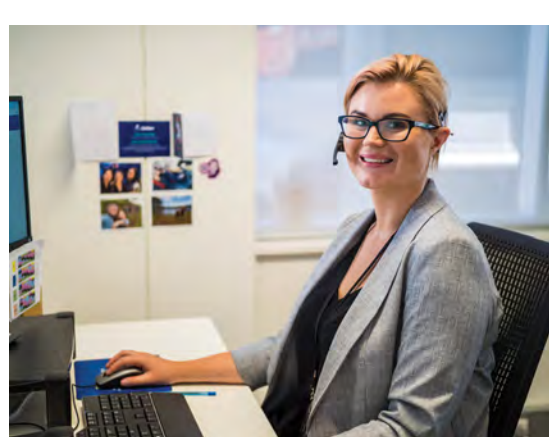
Our Student Adviser team can help you with study admin and non-academic related questions.

Visit unisaonline.edu.au/support to find out more.