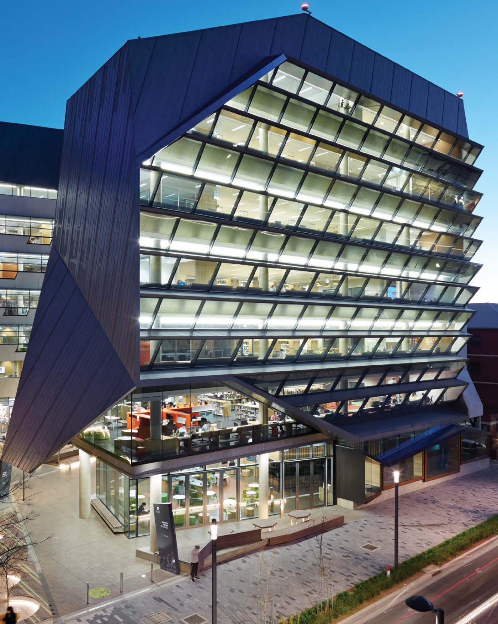
Image: The award-winning Jeffrey Smart Building at UNISA's City West campus.