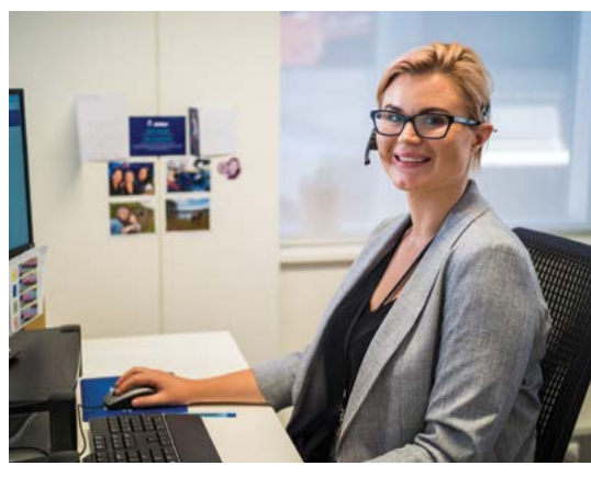
Our Student Adviser team can help you with study admin and non-academic related questions.

Visit unisaonline.edu.au/support to find out more.