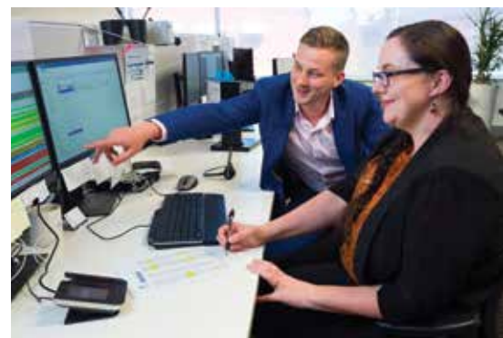
UniSA Online's student support team in action.