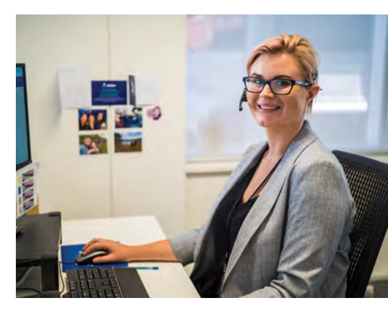
Our Student Adviser team can help you with study admin and non-academic related questions.

Visit unisaonline.edu.au/support to find out more.